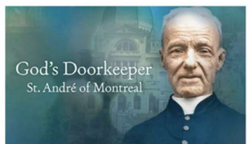
God's Doorkeeper St. André of Montreal

This week, we celebrate the memorial of a humble doorkeeper, St. André of Montreal. Learn how this man became a great saint through his small acts of love!