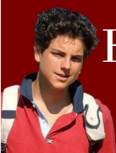
Bl. Carlo Acutis Patron of Youth & the Internet