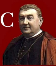
St. Manuel Garcia Bishop of the Abandoned Tabernacle