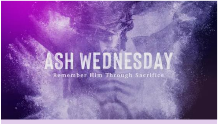
Schedule for Ash Wednesday

Free Will Offering All Proceeds to Benefit the Church Maintenance Fund