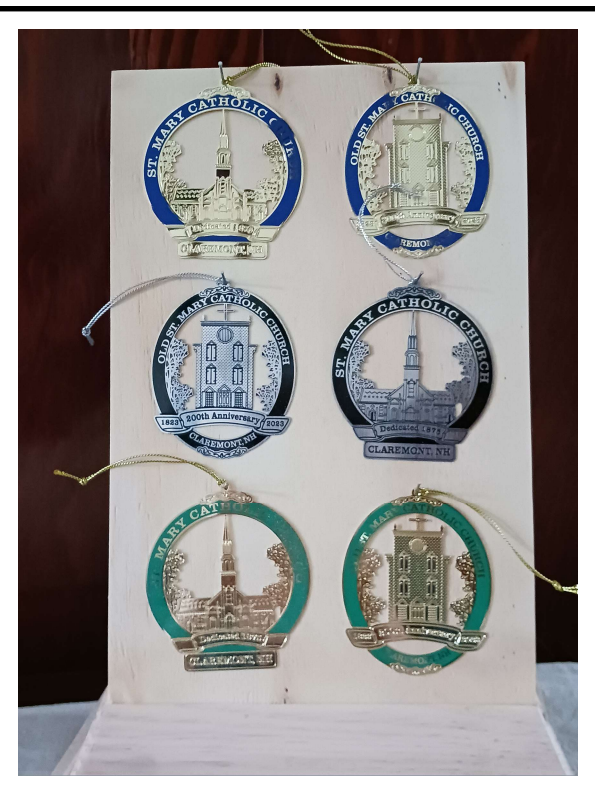
All proceeds will go to God's House, Our Home capital campaign. All funds raised beyond the total cost of the church exterior repair and restoration project will be used for additional capital improvement needs of the church. Please make checks payable to "God's House, Our Home."

Free Will Offering All Proceeds to Benefit the Church Maintenance Fund