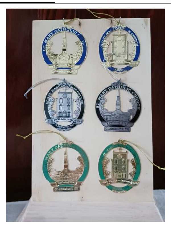
All proceeds will go to God's House, Our Home capital campaign. All funds raised beyond the total cost of the church exterior repair and restoration project will be used for additional capital improvement needs of the church. Please make checks payable to "God's House, Our Home."

Free Will Offering All proceeds to benefit the church maintenance fund